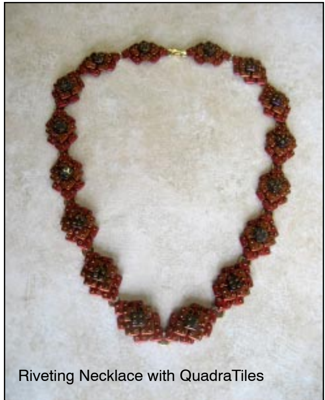
Riveting Necklace with QuadraTiles