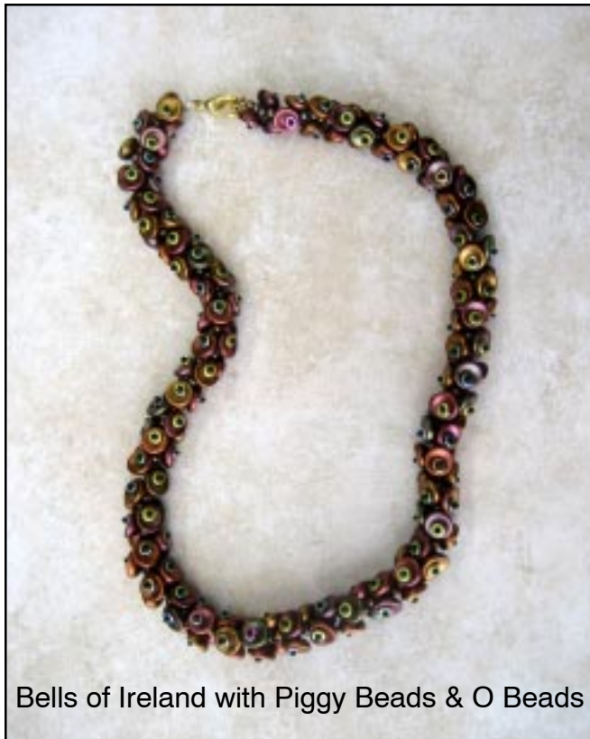
Bells of Ireland with Piggy Beads & O Beads