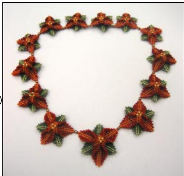
Red Trilliums Necklace