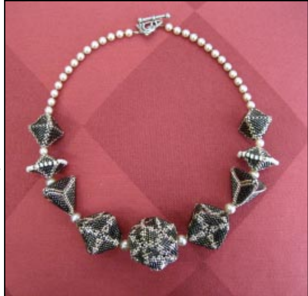
Necklace of Three-Dimensional Shapes